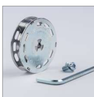
MONTI Adaptor System for 11mm AS-012