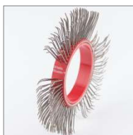
Bristle Blaster® Belt, steel, width 11mm box of 10 BB-034-10