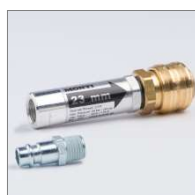
MONTI Air Pressure Regulator silver, for 23mm-Belts (reduces pressure to 6,2 bar) incl. coupling and nipple ZU-071