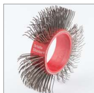
Bristle Blaster® Belt, steel, width 23mm box of 10 BB-033-10