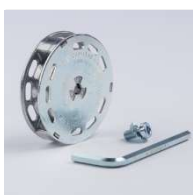
MONTI Adaptor System 11mm AS-012