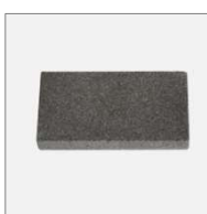
Resharpener Stone ZU-003

Keeping your Bristle Blaster in top-notch condition and ensuring staff are fully trained Presserv delivers spare parts, repair service and training.