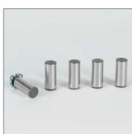
Bristle Blaster® Accelerator Bar, stainless steel, for 11mm-Belts 5 pieces ZU-063-05