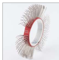
Bristle Blaster® belts Stainless steel | 11 mm box of 10 BB-103-10