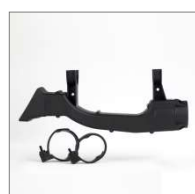
Dust Exhaust Attachment for Bristle Blaster® Pneumatic ZU-021