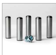
Bristle Blaster® Accelerator Bar, steel, for 23mm-Belts 5 pieces ZU-060-05