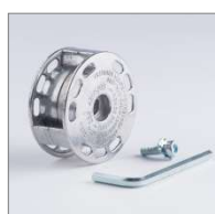
MONTI Adaptor System for 23mm AS-009