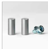
Accelerator bar, stainless steel 2 pieces ZU-065-02