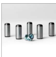
Bristle Blaster® Accelerator Bar, steel, for 11mm-Belts 5 pieces ZU-061-05