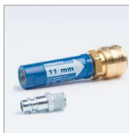
MONTI Air Pressure Regulator blue, for 11mm-Belts (reduces pressure to 5,2 bar) incl. coupling and nipple ZU-070