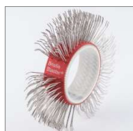
Bristle Blaster® Belt, stainless steel, width 23mm box of 10 BB-102-10