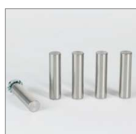
Bristle Blaster® Accelerator Bar, stainless steel, for 23mm-Belts 5 pieces ZU-062-05