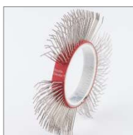
Bristle Blaster® Belt, stainless steel, width 11mm box of 10 BB-103-10